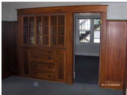
Large Main floor meeting rooms