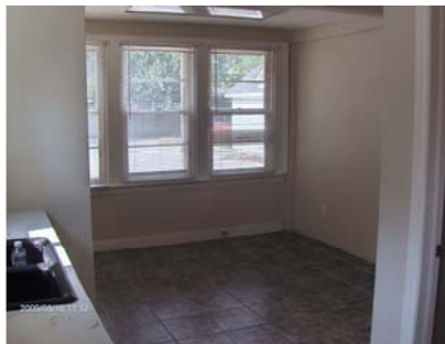
Dining Area with new flooring