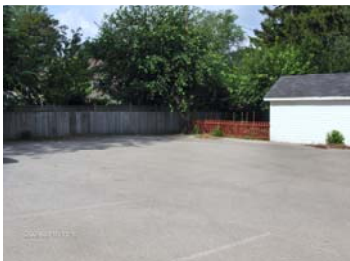
Rear Parking for 18 Cars

List Price: $389,000 | Exceptional Business Opportunity in Downtown St. Catharines