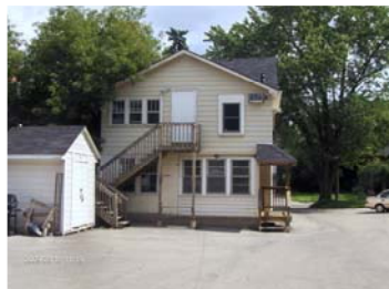
Rear View of Property & Parking