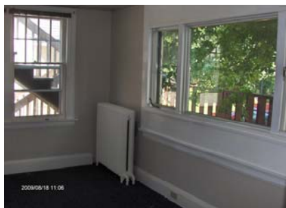
Large Windows throughout property