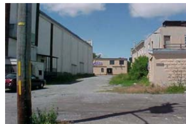
Side View—Vacant Lot